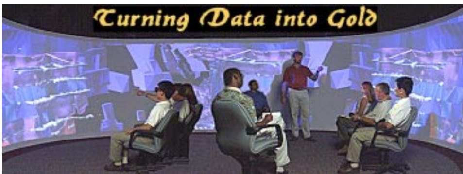
Project team discussing mine plan in Virtual Reality Laboratory

Amidst these and many other applications, it is clear that those who seize the opportunity will find themselves leading a technical revolution in the way research and business is conducted. Virtual Reality is not a wave of the future. It's a tool for the present.