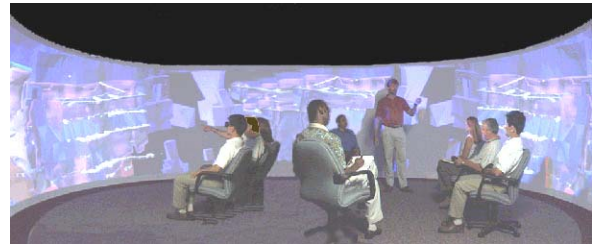
Project team discussing mine plan in Virtual Reality Laboratory