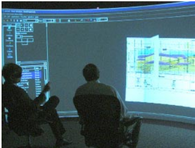
Project team identifying data gaps by converting 2D plans into 3D and viewing them in the VRL

Use VR to create “visual scientists” and support “visual engineers”, where seeing is not only believing but also convincing.